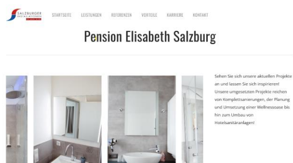
Reference Salzburger Installationen

The extensive renovations created real added value for guests, taking into account customer requests and complaints as well as the modern requirements of international city tourism and the Thallmayer family's own travel experience. The result is a well-thought-out concept in which a lot of attention was paid to practical details in order to be able to offer travelers from all over the world the highest possible level of comfort - even in inexpensive economy rooms.